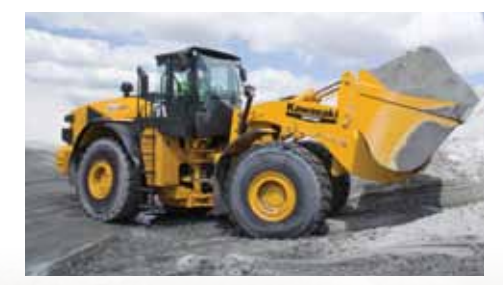
Both the 95Z7XT and the 115Z7XT were tested in various applications.

configuration loader. KCM designed these loaders in conjunction with the Tier 4i loaders introduced in 2013. After testing extensively in the North America market to rave reviews, the loaders are now in mass production. Response from the Field has been overwhelmingly positive.